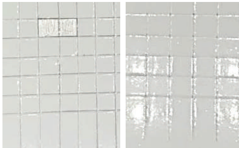
Aluminum Cold Rolled Steel 15 mil WFT, Cured 7 Days, Permacel Tape